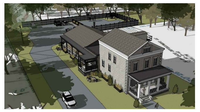
Initial architectural rendering of the future Family Homeless Shelter.

When Covid hit in early 2020, FPOC paused that "rotational program" and, with help from federal pandemic relief grants, began renting apartments to use as emergency single-family shelters.