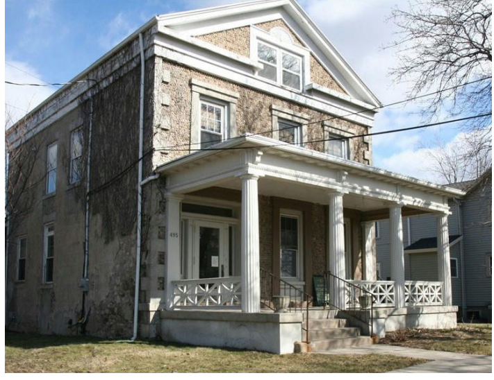
Historic Cobblestone Manor, viewed from North Main Street, will become Ontario County's first shelter for homeless families.

By early 2023 FPOC could host as many as eight families in these emergency apartments, but by that time pandemic funding was slated to run out. FPOC stepped up its search for what the Family Promise national organization calls a "static site" – a single building that can provide family bedrooms for several families, along with staff offices, cooking and dining facilities, classrooms, and recreation space. FPOC considered several buildings around the county in early 2023 and identified Cobblestone Manor as the ideal location for a family shelter, but the cost was prohibitive.